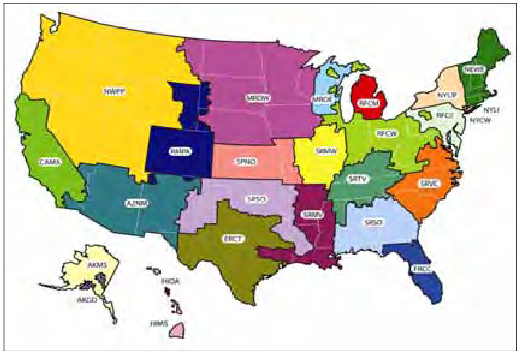
Year 2005 eGRID Subregion Emissions, CO<sub>2</sub> Greenhouse Gas