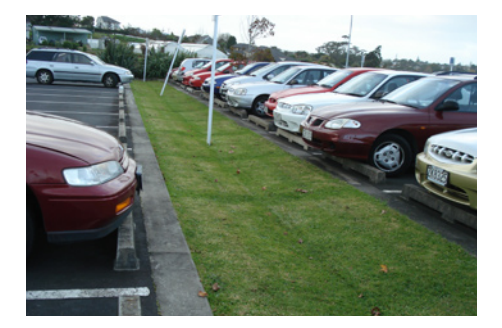
Fig.2 Waitakere City Hospital car park swale