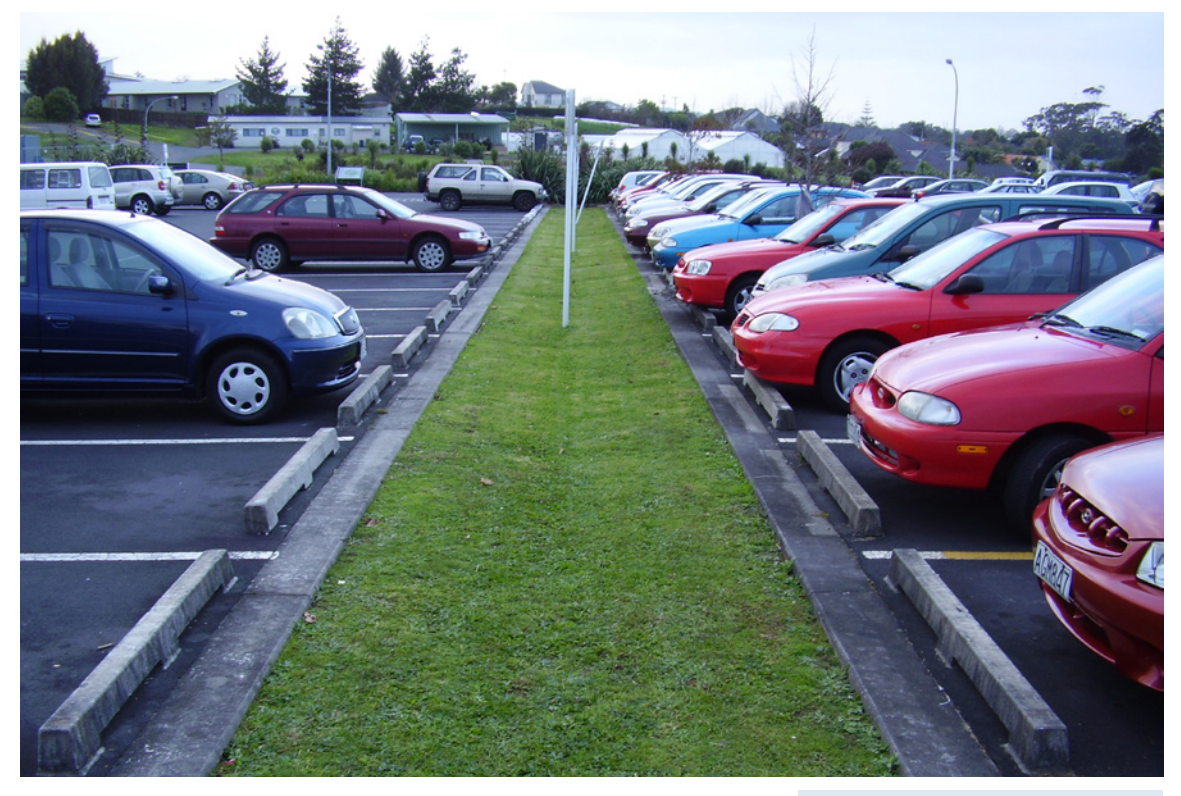
Fig.1 Swale in Waitakere City

Swales, also known as bioretention, filter or infiltration strips, are broad, grass channels used to treat stormwater runoff. They direct and slow stormwater across grass or similar ground cover and through the soil. Swales also help filter sediments, nutrients and contaminants from incoming stormwater before discharging to downstream stormwater system or waterways. Some swales have liners to direct filtered runoff, or rocky linings to slow fast flows. Swales are simple to maintain and can fit well in urban design.