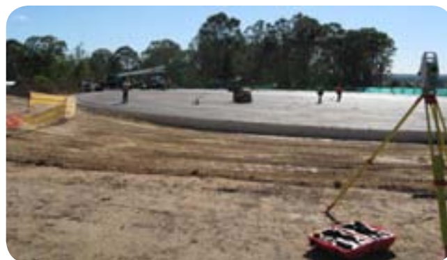
One of the large new drinking water reservoirs for this growth area under construction

Approximate estimated total cost: $128 million