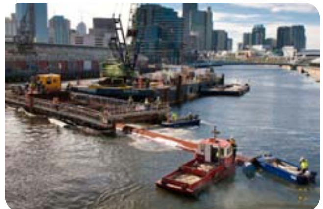
The coffer dam at the Melbourne Main Sewer Replacement crossing of the Yarra River

Approximate estimated total cost: $220 million.