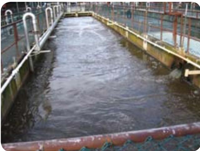
A secondary treatment tanks at Warriewood nearing capacity and indicating the need for amplification

Approximate estimated total cost: $31 million.