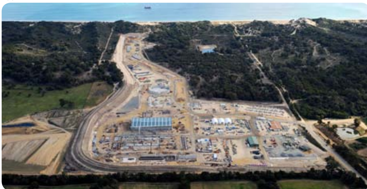
Southern Seawater Desalination Plant - recent aerial photo of the works area

Approximate estimated total cost: $76 million.