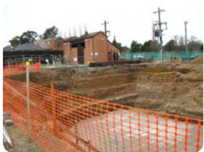
Asset Infrastructure Renewals - a replacement and larger sewage pumping station being built next to the old station

Sydney Water is delivering a significant renewals and rehabilitation program across a range of asset types comprising: $120 million per year to renew critical water mains and water reticulation mains; $60 million per year to rehabilitate critical sewer mains; $30 million per year to renew water and wastewater treatment facilities; and $25 million per year to renew water and wastewater pumping stations.