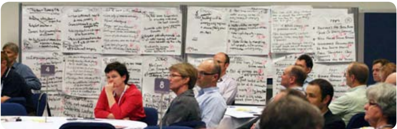
OzWater 10 Conference in Brisbane - delegates consider outputs from working groups

More recently, Melbourne Water and WSAA held a one day session on Cities of the Future at the Enviro conference in Melbourne in July 2010. In this session a smaller group of people worked on the actions required to implement the principles identified at the OzWater workshop. These actions