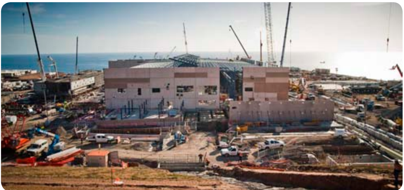
Adelaide Desalination Plant's Reverse Osmosis Building 1 under construction

Approximate estimated total cost: $12 million