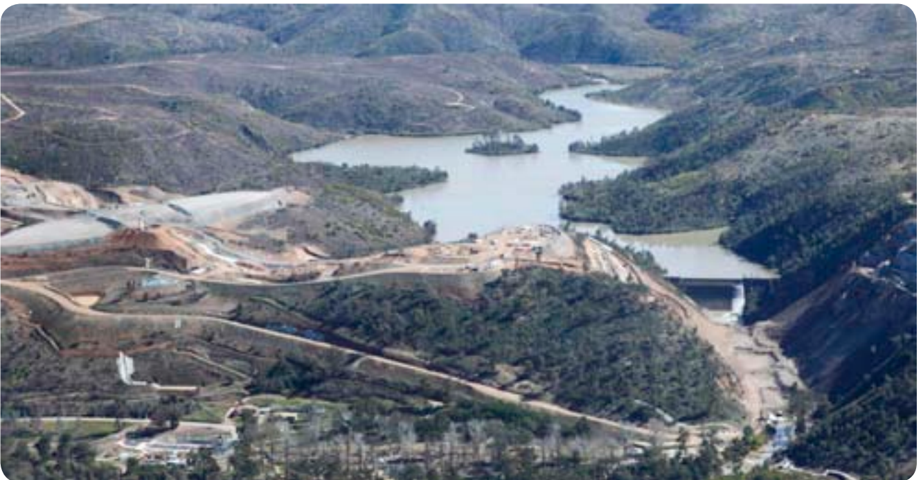
Recent aerial photo of Cotter Dam at 100% capacity with enlargement works in the foreground

The sewerage treatment facility required upgrading to cater for future growth in population and load. The project includes three secondary clarifiers, additional bioreactor tanks and associated pump stations and chemical dosing facilities.