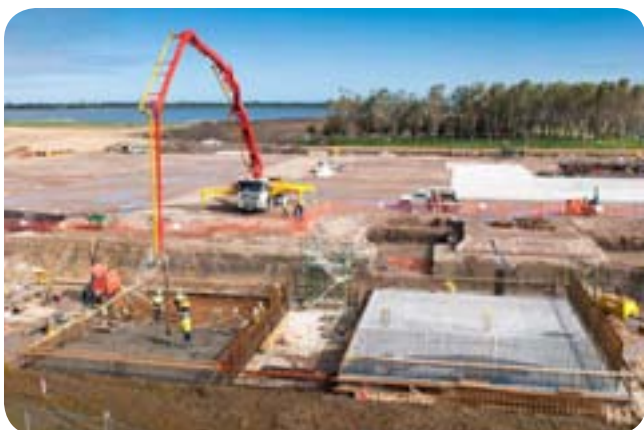
Eastern Treatment Plant - Tertiary Upgrade - work begins on the foundations for the biological media filters as part of the upgrade.

Approximate estimated total cost: $380 million.