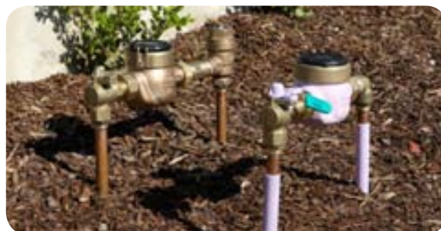
Dual pipes and meters

Approximate estimated total cost: $99 million.