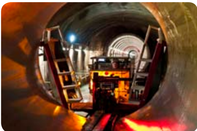
Northern Sewerage Project - inside a new section

Approximate estimated total cost: $650 million - Melbourne Water $422 million: Yarra Valley Water $228 million).