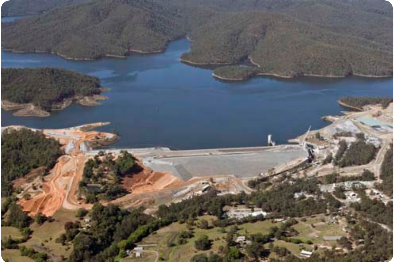
Hinze Dam Stage 3 upgrade works in progress

Approximate estimated total cost: $348 million.